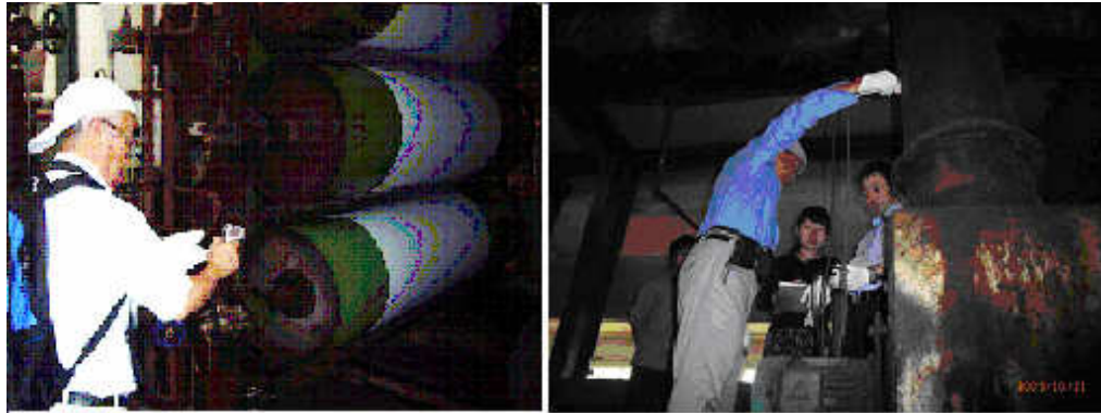
photograph about measurement of heat loss in dryer 2011-2012

(5) Seminar for reviving and activating policy making with corporations and association in productive area in Japan, with several professional engineers' participating.