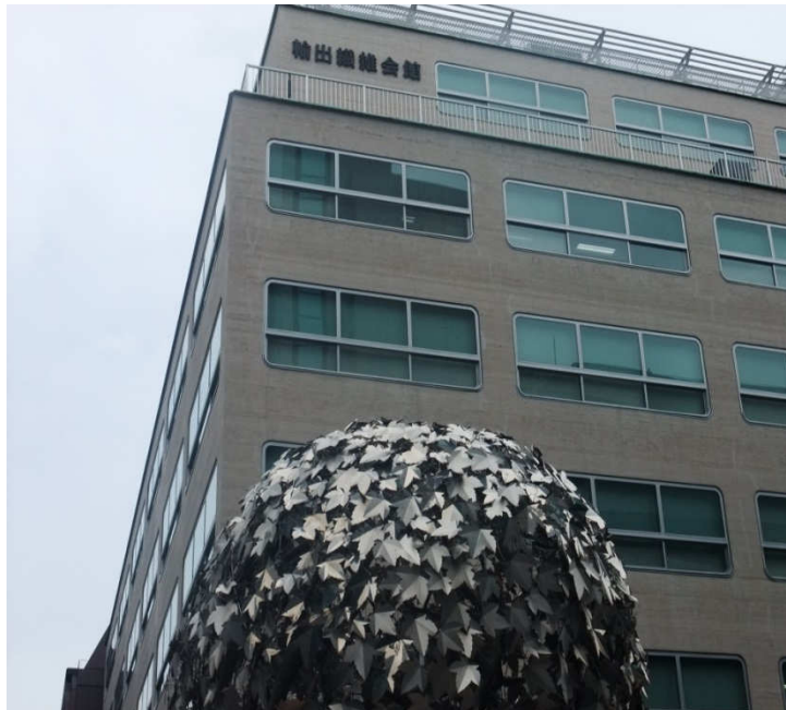
JTCC's Head Office (6-floor)

Japan Textile Professional Engineers Center (JTCC)